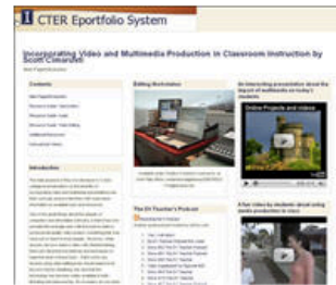
Incorporating Video and Multimedia Production in Classroom Instruction by Scott Cimarusti

** More examples of Mahara course projects from EPSY 590 NET.